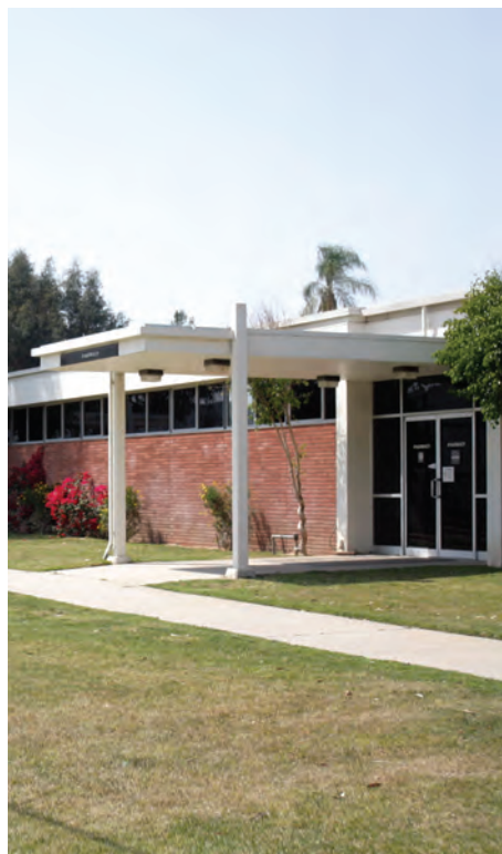
SAC Health System, which will celebrate 20 years at its Norton location in San Bernardino this October, has received a new designation that will allow it to apply for important grants and will result in tuition reimbursement for staff members' continuing education.

In October, SAC Health System will celebrate 20 years at its current location on the former Norton Air Force Base in San Bernardino.