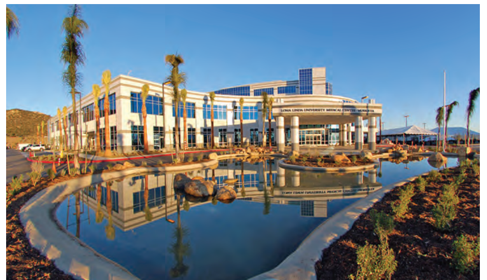
LLUMC – Murrieta opened its doors in April 2011.