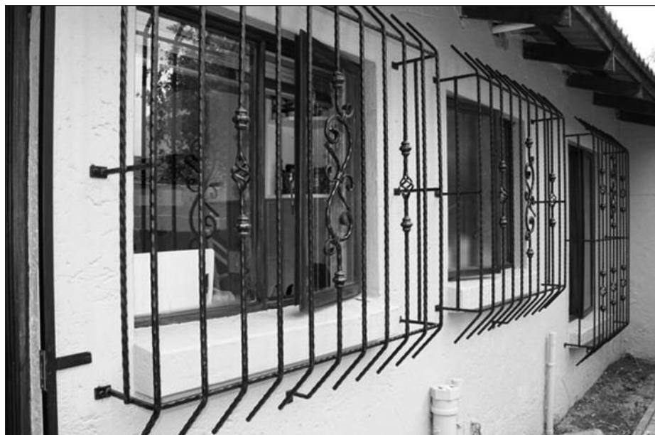
A needs assessment study of a San Bernardino Housing Authority neighborhood showed that many residents don't even know their neighbors because they are afraid to leave their homes. The study was conducted by faculty and students in the department of counseling and family sciences, part of the LLU School of Science and Technology.

"Our study was primarily interested in looking at interactions between the community resi-