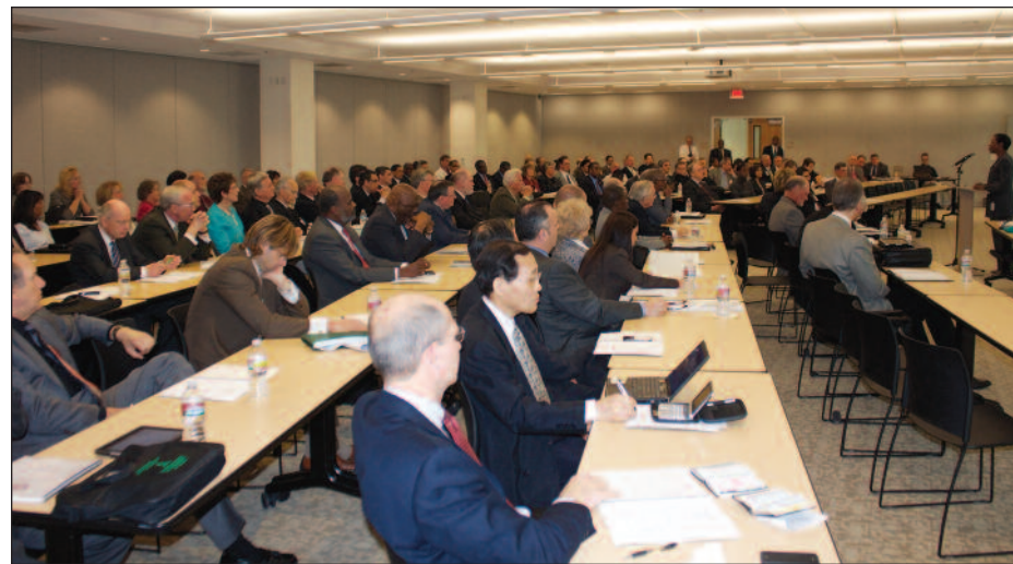
Approximately 130 leaders of the various LLU entities and the Seventh-day Adventist Church attended the corporate membership meeting.

For 35 years, the university has run academic programs overseas to train students in many nations who then go on to help their fellow countrymen receive proper care. Additionally, LLU Medical Center clinicians serve as mentors to raise the skill level of visiting health care professionals from other countries. In 2010, for example, 78 professionals from 15 countries