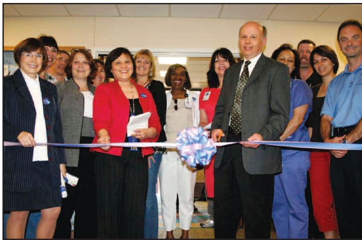
Officials of Loma Linda University Children's Hospital gather in front of the waiting area on the neonatal intensive care unit to cut the ceremonial ribbon commemorating unit 3700's rollout of Innovating Excellence principles. The 3700 rollout on Tuesday, March 31, 2009, marked the final unit to officially adopt the Innovating Excellence program.