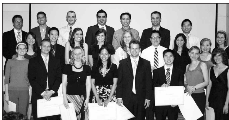
It's high-wattage smiles all around as 26 members of the LLU School of Medicine class of 2009 celebrate their induction into the Epsilon chapter of the Alpha Omega Alpha medical honor society. The group was initiated into the society on Wednesday, March 16, 2009.

Membership in AOA is considered one of the highest privileges offered to the nation's medical students, faculty members, and staff.