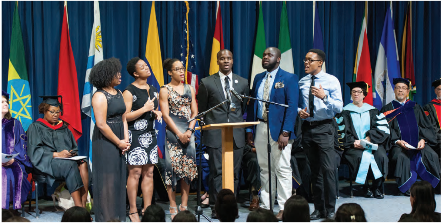
Members of the Black Health Professional Student Association share special music during Loma Linda University Health's 2017 Diversity Consecration Service.