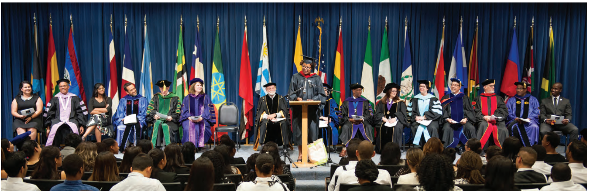
University administrators and school deans took part in the Diversity Consecration Service, held in Randall Amphitheater on May 19.