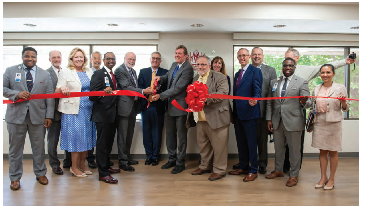
Loma Linda University Health leaders celebrate the opening of the Neuropathic Therapy Center by cutting a ribbon, symbolizing the center's opening.