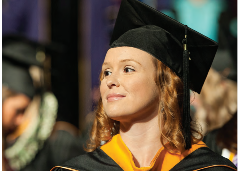
Members of the Class of 2017, like this School of Nursing graduate, have exciting futures before them.