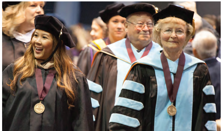
Faculty members from each school led their graduates into the various commencement ceremonies.